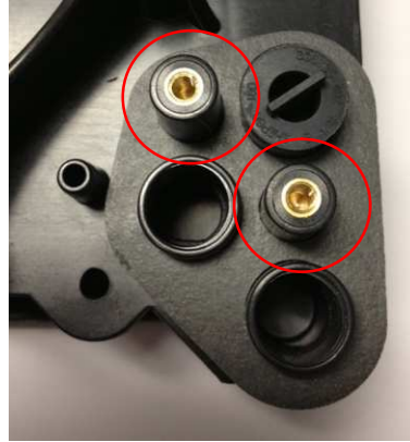
Figure 3: Plastic mounting posts