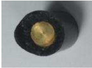
Figure 2: Bottom of brass insert in plastic mounting post