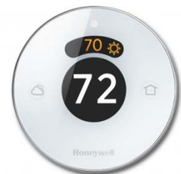
Honeywell TH8732WF5018 - $247

be necessary. The Lyric thermostat will automatically adjust based on your smartphone's location. So, you get comfort when you're home and savings when you're away.