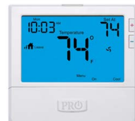
Pro1 T855i - $100

For your cost conscious consumers who want remote access, Pro1 has the solution. It's a deluxe thermostat with an easy to use phone or tablet app. Plus, it's a simple upgrade for any existing Pro1 homeowner as the back-plate is the same as what's on the wall today.