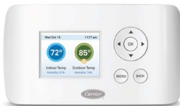
Carrier TC-WHS01 - $154

Carrier's Comfort Series thermostat features a color display which can show local weather, maintenance reminders and indoor temperature/humidity. The intuitive phone or tablet app provides remote access while the website login offers detailed reports, system data and runtime information.