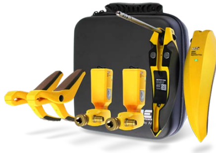
HUB6 Smart Refrigerant Charging Kit