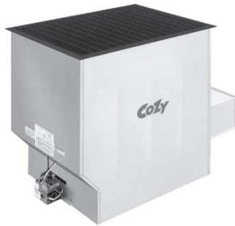
90N30 and 90N50

The Cozy Challenger features a factory-mounted control with built-in pressure regulator and 100% safety pilot. The millivolt controls require no electricity to operate, so losing heat during a power failure is never an issue. The combustion chamber has continuous-seam welded steel and is warranted for 10 years.